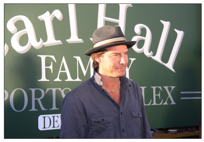
Ty Pennington at the Sports Complex dedication.